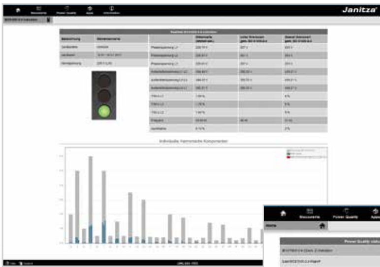
Fig.: IEC 61000-2-4 analysis with traffic-light principle